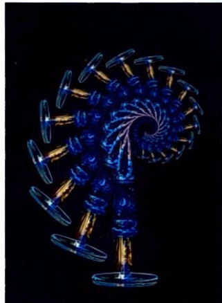
Trajectory in Blue