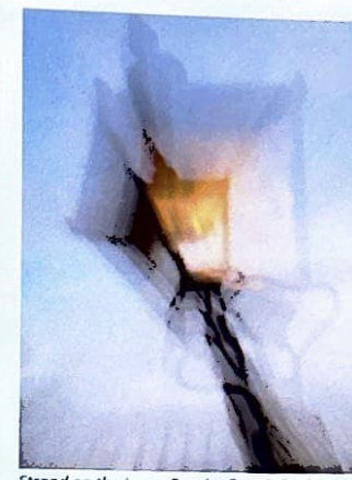
Strand on the Lamp Post