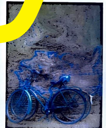
Bike Trail