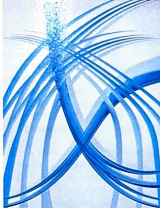
Reticulated Blue by Mary Auckland ARPS