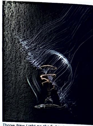
Throw New Light on the Subject by Steve Peel LRPS