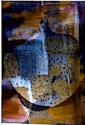
Vocellum by Sandy Cowie ARPS